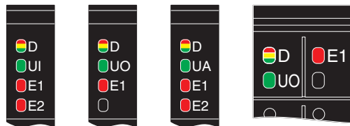
Figure 1-3 LEDs D and E on the power connectors of the I/O modules (examples)